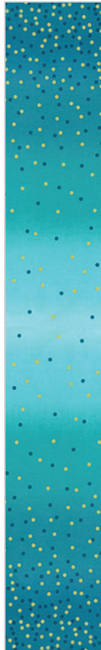
10807 209M Turquoise