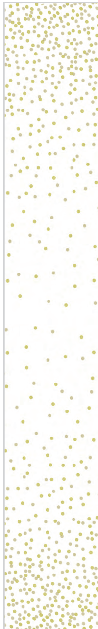
10807 332M Off White