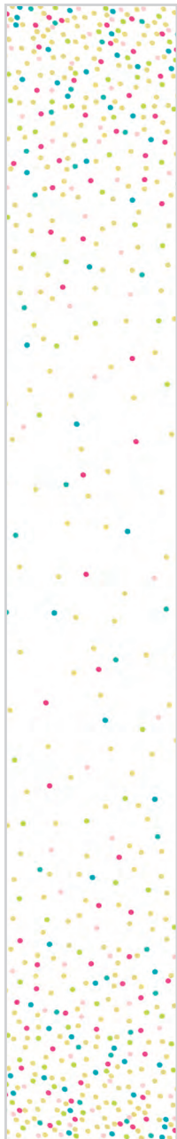
10807 333M Multi