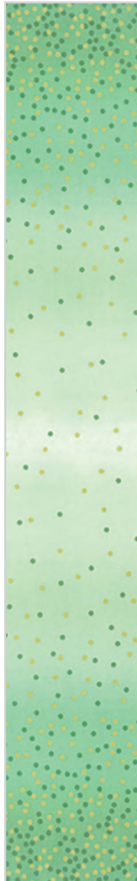
10807 210M Mint