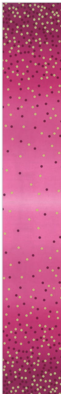
10807 201M Magenta