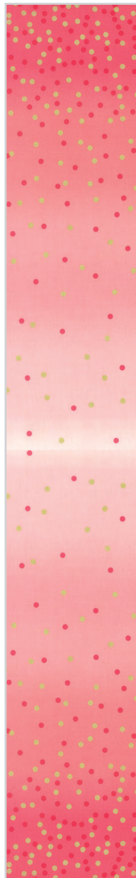
10807 226M Popsicle Pink