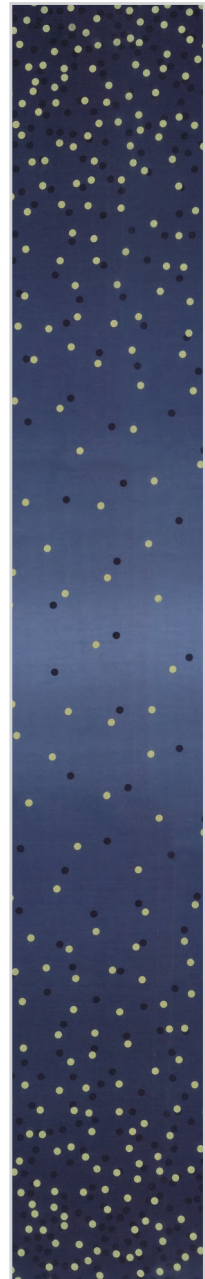
10807 225M Indigo