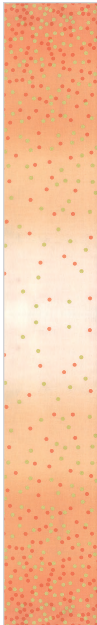
10807 221M Coral