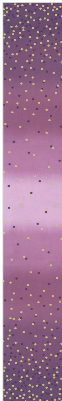
10807 319M Mauve

Check out our 108" Ombre Confetti Quilt Backs