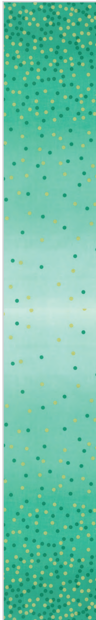
10807 31M Teal