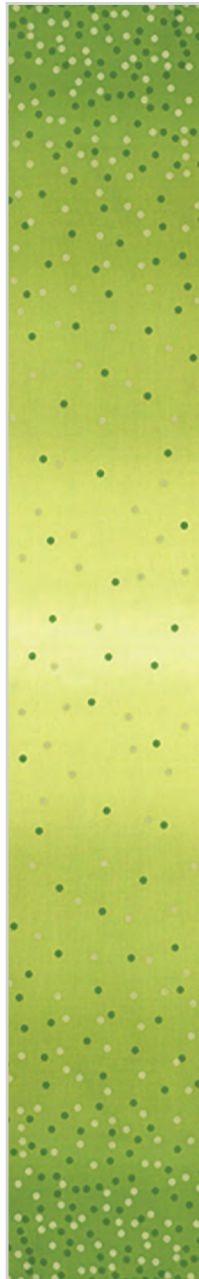
10807 18M Lime Green