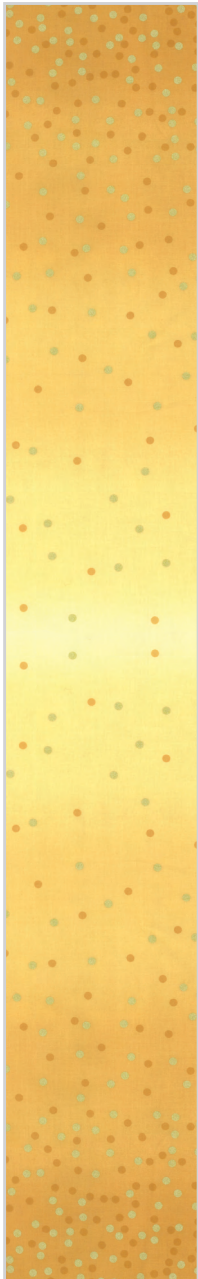
10807 219M Honey