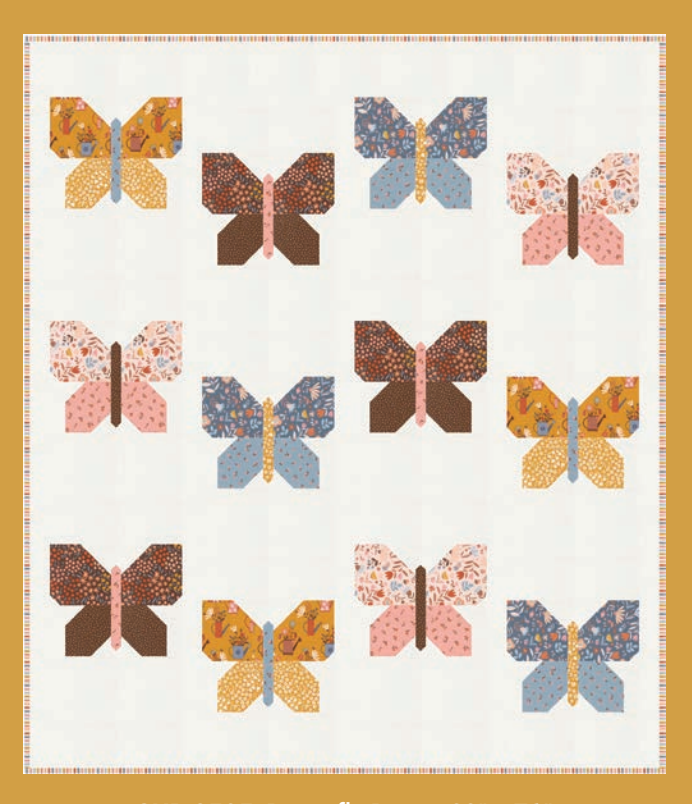
CHD 2505 Butterfly Dance 62" x 71" by Coach House Designs