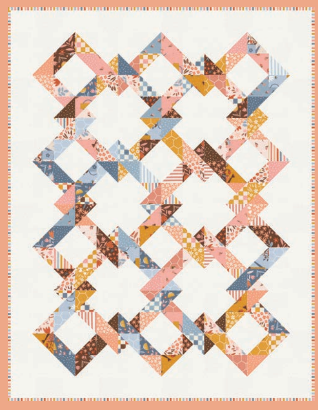
ISE 228 Knot Today 53" x 68" PP Friendly by It's Sew Emma