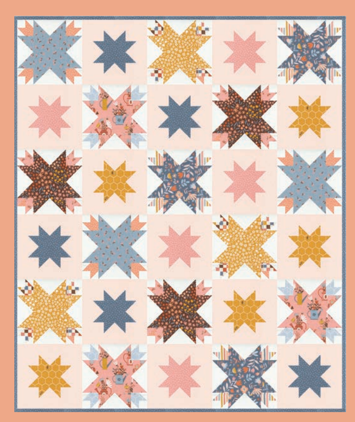
SS 532 Daphne 60" x 72" by Splendid Speck