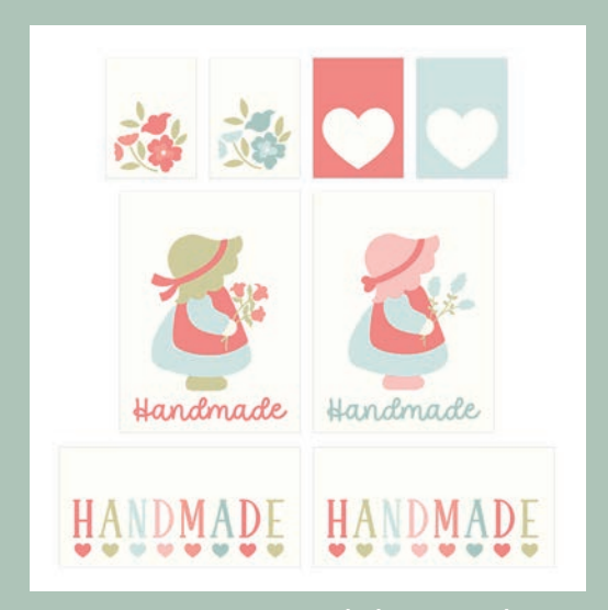
MSQL 115N Woven Labels 8 ct Mul 3