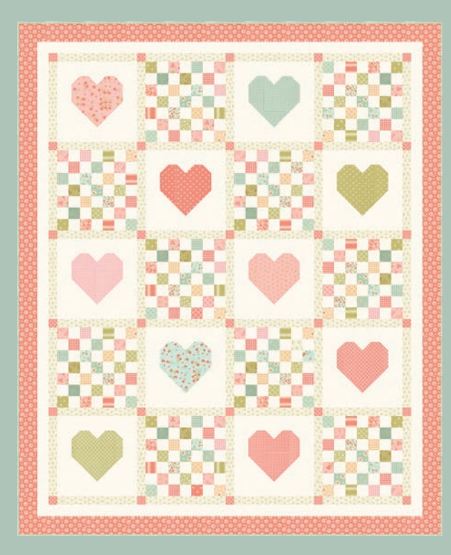
MSQL 180 Happy Hearts 75" x 90" LC Friendly