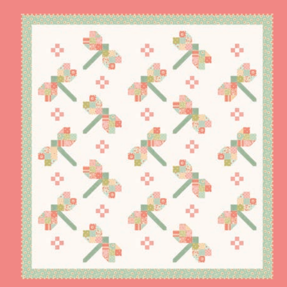
Dragonfly Patches 59" x 62" Only available with purchase of Collector Series Tin