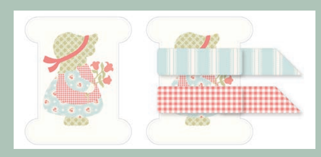
MSQL 116N Binding Holder Mul 2