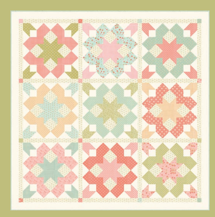
MSQL 183 Starburst 72" x 72"