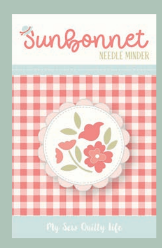
MSQL 113N Zipper Pull Mul 3 MSQL 112N Needle Minder Mul 3