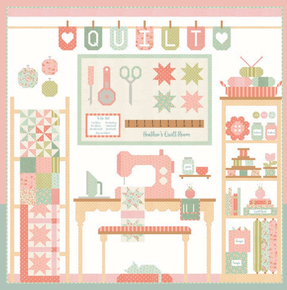
MSQL 184 Quilt Room BOM 70" x 70"