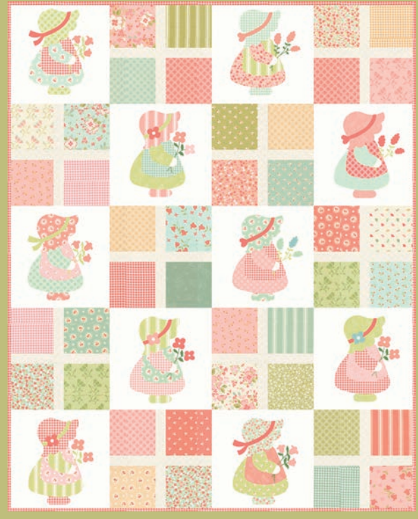
FREE PATTERN Hopscotch 40" x 50" PP Friendly