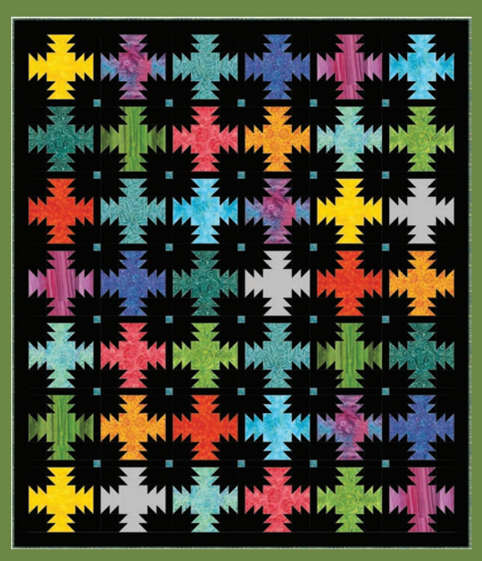
WS 48 Prairie Blossom 63" x 72" by Wendy Sheppard