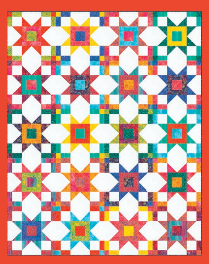
MM 014 Gravitate 60" x 75" AB Friendly by Modernly Morgan mocla 95