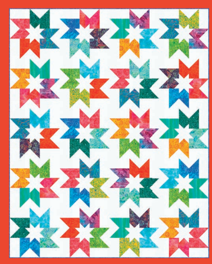
MM 011 Cosmic Crush 60" x 75" AB Friendly by Modernly Morgan